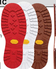
24 Red 26 White 29 Amber