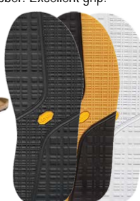
00 Black 03 Black / Gum White 06