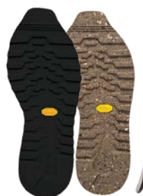
80 Black 89 Eco