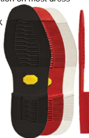
10 Black 14 Red 16 Cream