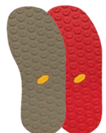
82 Grey 84 Red