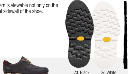
20 Black 26 White