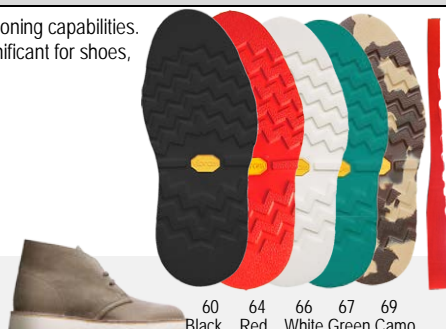
60 Black 64 Red 66 White 67 Green 69 Camo