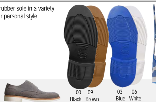
00 Black 09 Brown 03 Blue 06 White