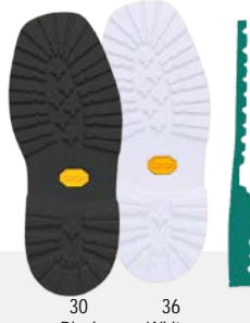
30 Black 36 White