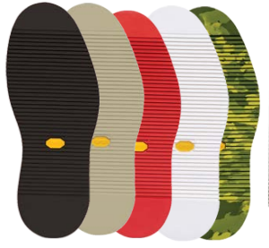
00 Black 02 Grey 04 Red 06 White 09 Camo (7.5 di)