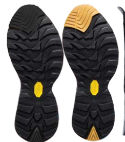
70 Black 73 Black/Gum